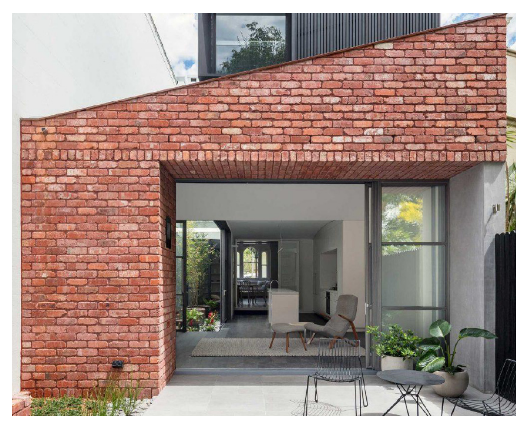
Fig. 2. Recycled brick

bricks and stone elements. To a lesser extent, the recycling potential emerges with regard to elements such as ceramic, concrete, and silicate blocks. However, the problem stems in this case from the method of joining such elements, i.e., with mortar or glue. Additionally, their brittleness and, usually, an additional layer of plaster may pose difficulties. Currently, this group of materials has a rather low recovery potential when it comes to masonry elements of a demolished building. Therefore, most of this material ends up as construction debris. Additionally, it is worth considering the amount of work required to recover small-size elements. Recycling may be unprofitable in the case of materials with little aesthetic value. One desirable material in this category is the demolition brick which can be used in new investments or as a material for renovating historic buildings (Fig. 2).