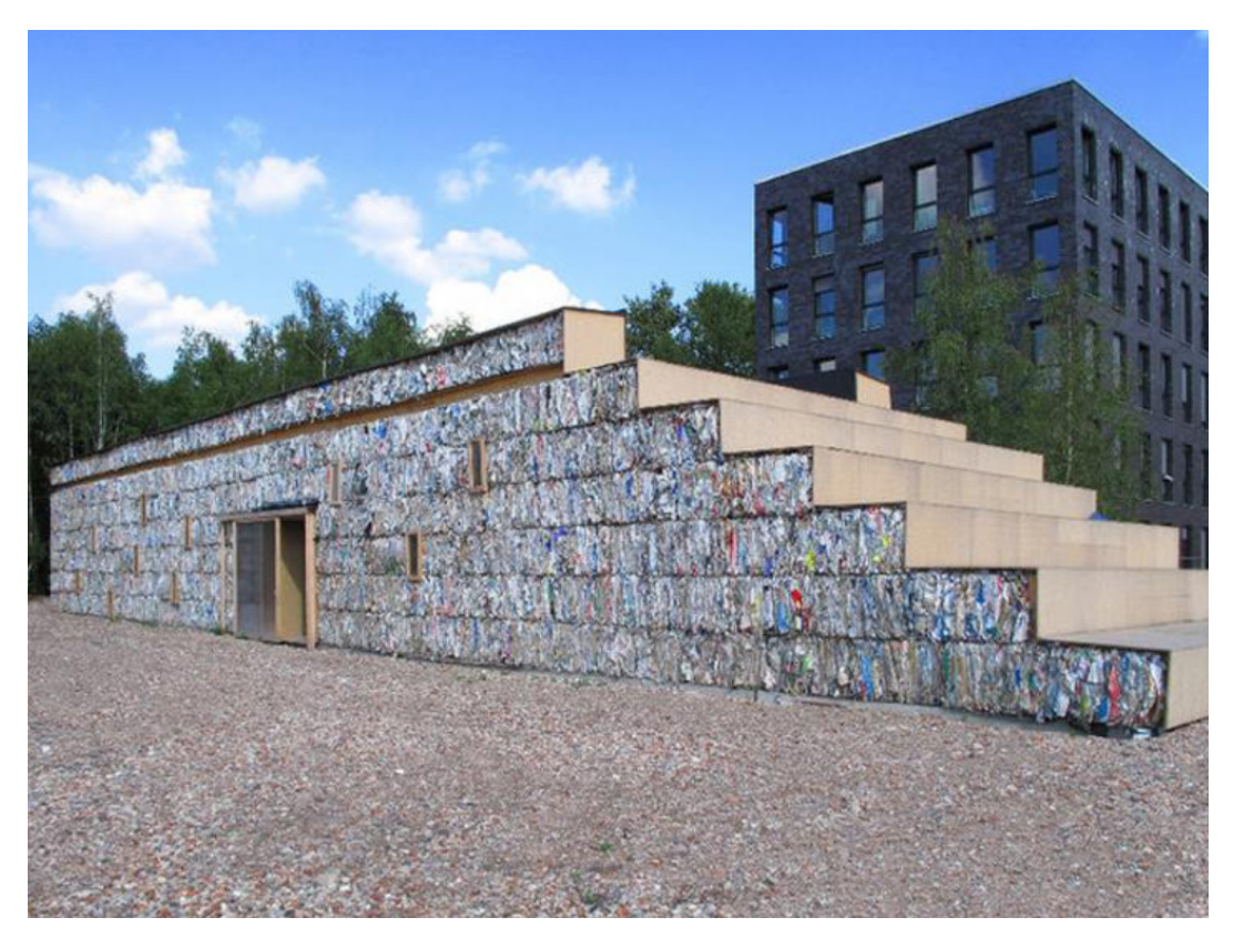
Fig. 4. Paperhouse