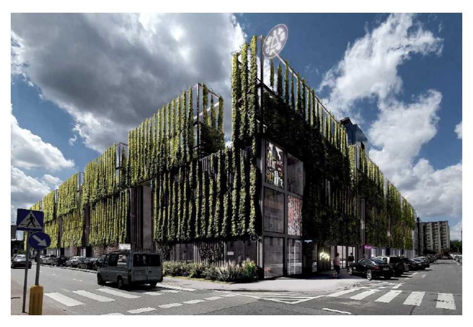
Fig. 5. Implant building