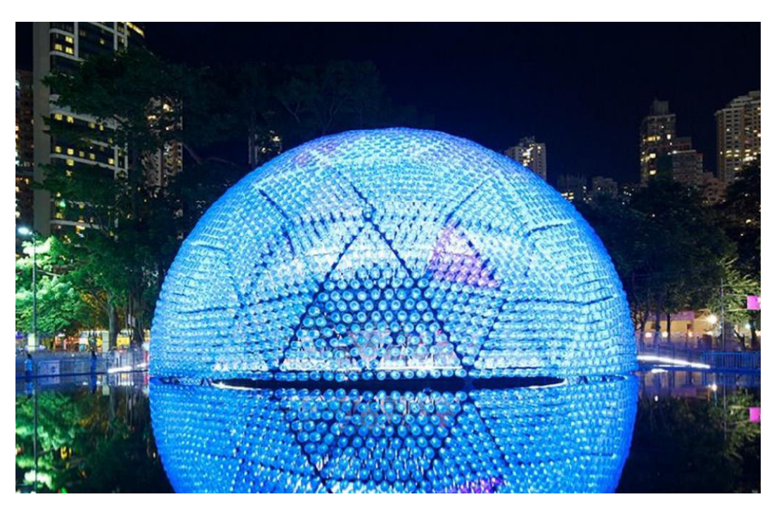
Fig. 3. Rising Moon pavilion

The situation differs in middle-developed and underdeveloped countries, where the use of waste results from purely economic factors and the lack of building materials. Inhabitants of poverty districts and slums use the materials available to create shelter and