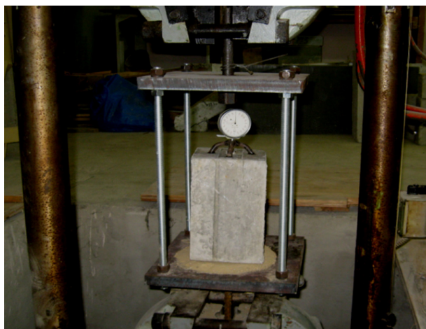
Fig. 2. General look of testing the samples

The limit average shearing stresses ( f_b ), appearing on the contact surface between a bar and concrete and defined by the Eq. (1), can be called as the bond