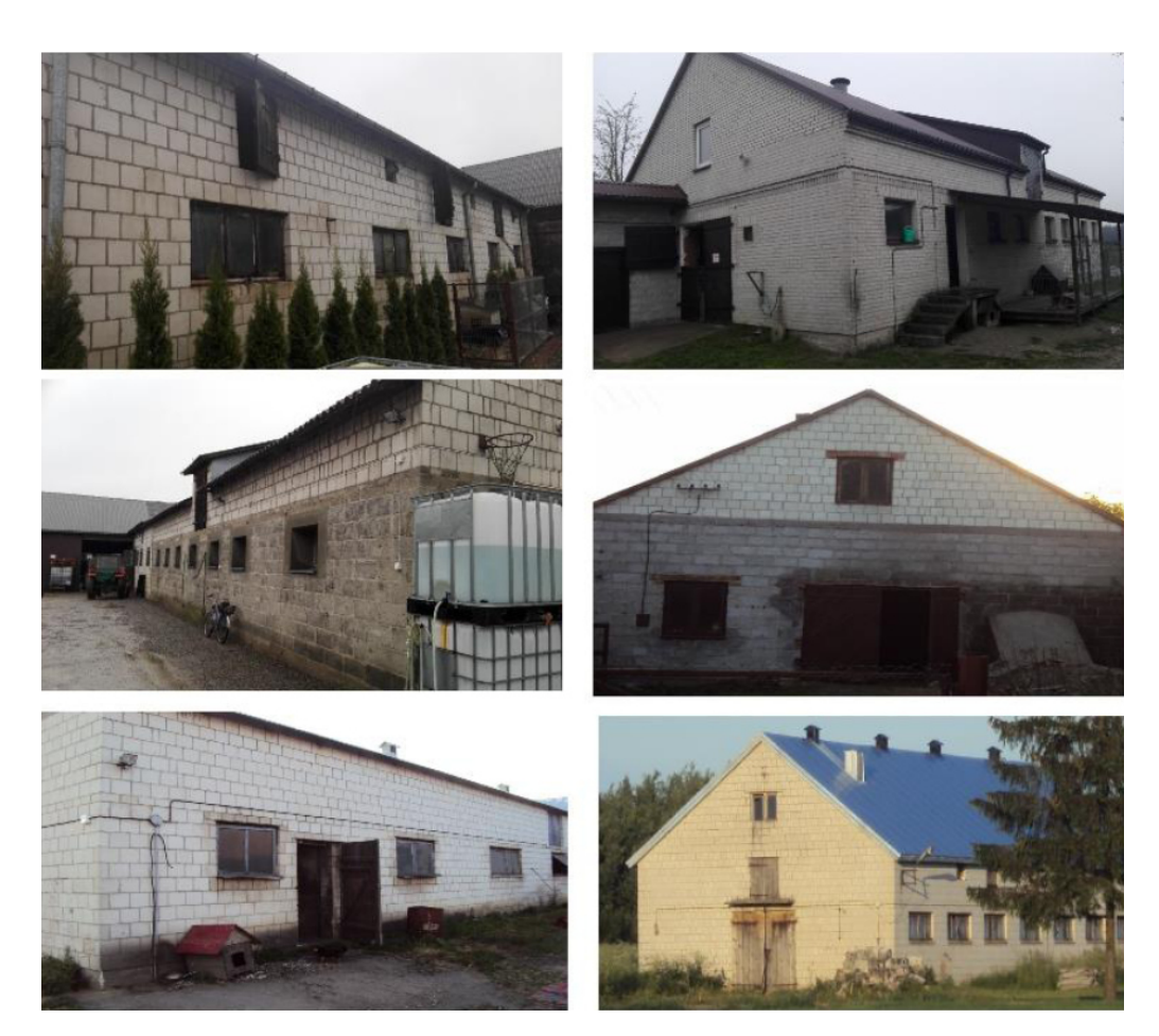
Fig. 3. Piggeries in the investigated farms