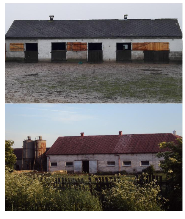
Fig. 5. Stables in the investigated farms