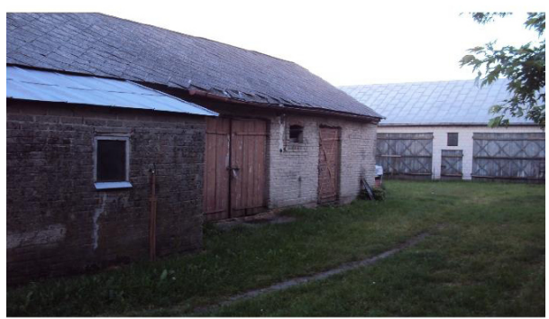
Fig. 4. Sheep sheds in the investigated farms