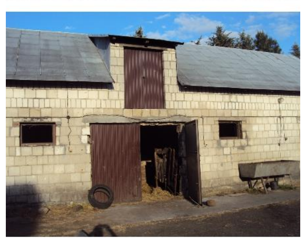
Fig. 6. Cowsheds in the investigated farms