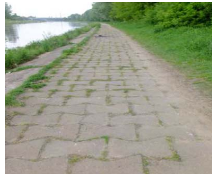
Fig. 11. Concrete blocks pavement of pedestrian-bike track in Malta

asphalt concrete. A pedestrian-bike asphalt route along the northern bank features a very intensive traffic, especially in spring–summer time. The technical state of pedestrian and bike tracks around Malta is very good.