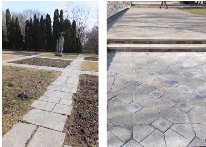
Fig. 7. Decorative stone and concrete slabs in Cytadela Park

The pedestrian-bike route around the Malta Lake is mostly built from asphalt concrete (Fig. 9). Only few side access routes or squares are made from concrete slabs (Fig. 10) or concrete blocks (Fig. 11). Pedestrian and bike traffic along the southern bank of the lake are separated. However, both tracks are made from