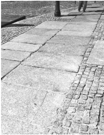
Fig. 3. Material solution for pavement around Old Market Place