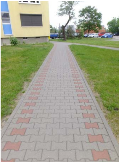
Fig. 5. Concrete blocks pavement in Bolesław Chrobry district