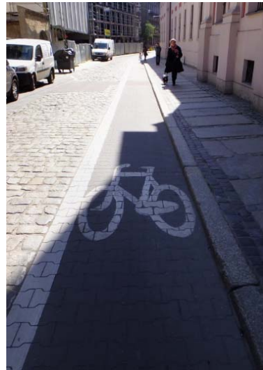
Fig. 4. Counterflow along Za Bramką Street