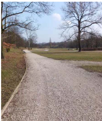
Fig. 8. Gravel pavement in Cytadela Park