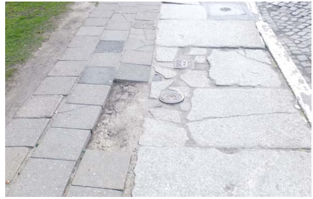
Fig. 2. Pavement state in Grochowe Łąki Street