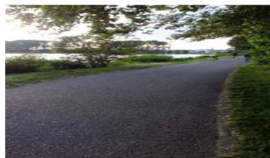
Fig. 9. Asphalt concrete pavement of pedestrian-bike track in Malta