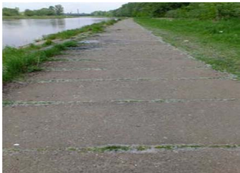
Fig. 10. Concrete slab pavement of pedestrian-bike track in Malta