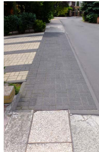
Fig. 6. Various pavement types of pedestrian tracks between the detached houses in Piątkowo