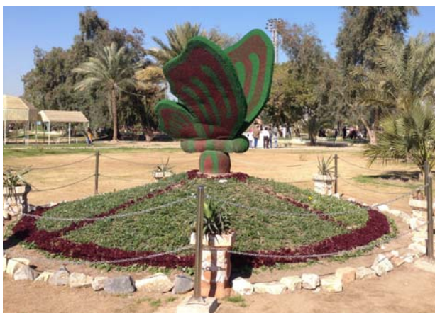
Fig. 7. Vertical flowerbed depicting the butterfly