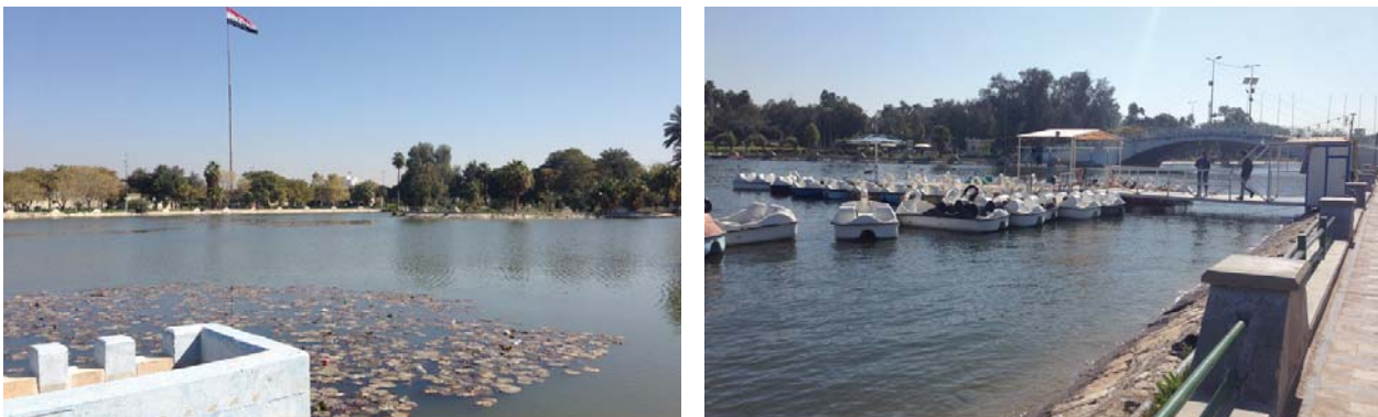
Fig. 3. Lakes and canals where lilies bloom and where you can go boating and pedalos