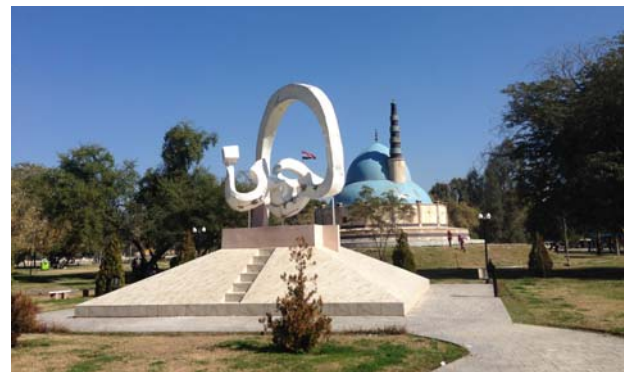
Fig. 6. Contemporary art in a park setting

especially in the eastern part of the park, made in different styles, eg. classical sculpture of a physician and scholar (Farabi) near the Natural History Museum, an Arabian horse (Flying Horse) surrounded by fountains near a popular meeting place (Fig. 5), contemporary art (Fig. 6) and vertical flowerbed depicting the butterfly (Fig. 7). In addition, the space of the park is decorated with some objects characteristic of a given season: Pergola with hearts for Valentine's Day or the enormous Christmas tree to celebrate Christmas. The air surrounded by benches is moisturized by water cascade. Tall trees cast a shadow on the walking paths and seating places. Along them there are also water canals with the fountains. One avenue runs under the pergola formed out of the bushes (Fig. 8).