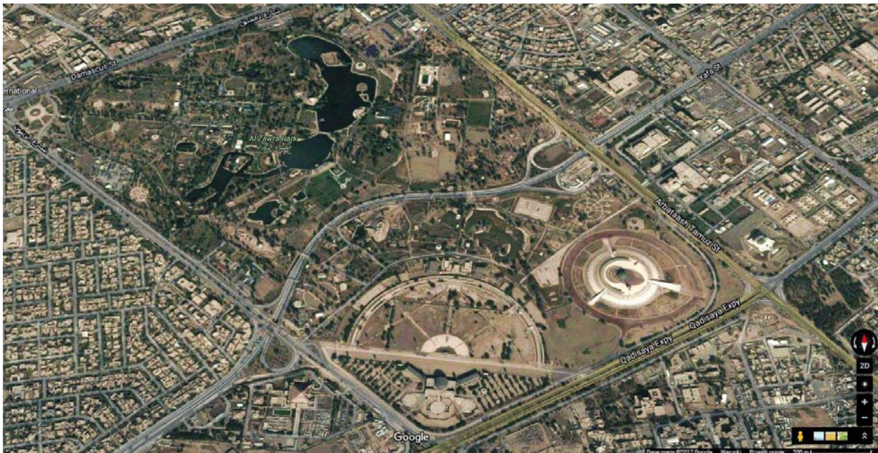
Fig. 2. View 3D Zawraa Park. Pobrano z lokalizacji: https://www.google.pl/maps/@33.2787384,44.3821725,4316a,20y,40.8t/data=!3m1!1e3