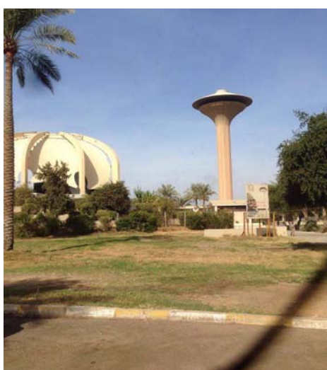
Fig. 13. TV Tower and vantage point