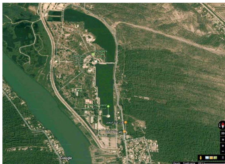
Fig. 12. 3D view on Baghdad Island. Pobrano z lokalizacji: https://www.google.pl/maps/@33.4084148,44.3416998,4308a,20y,40.8t/data=!3m1!1e3

Baghdad Island is a small cape located in northern Baghdad, bordered on one side with the Tigris River, and on three others with the lake. The construction took place from 1980 to 1982 and was carried out by two Finnish construction companies YIT and Vesi-Pekka. The construction work involved forming, from the side of the river, two-kilometre long embankment, the construction of 6 bridges, internal roads, water, sewage and electricity supplies, water intakes and sewage treatment plants. In its heyday it was the object as popular as Disney parks. During the war in 2003, the park was ransacked. Again, it has been open since 2009, but its renovation work has been continued. The composition of the park is based on a symmetric stellar system (Fig. 12). Alleys go out radially from a central island with a TV tower (Fig. 13 and 14). The tower offers a distant view of the park and