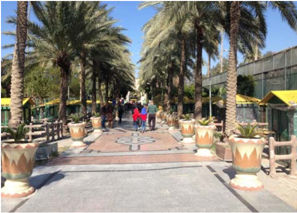
Fig. 9. In the park there are numerous cafes and restaurants

Surrounded by gardens Zaawara Tower with a height of 60 m, has two restaurants and cafes, and can accommodate 170 people. The top of the tower offers a view of the park and the city. One of the most important objects is Planetarium – performing the research and educational functions. It is also a museum and amateur radio. In the park there are plenty of eateries, cafés and shops (Fig. 9). From modest kiosks to the most sophisticated restaurants, eg. Al Lulua (‘a pearl’) which roof is topped with a dome similar to a pearl. There is also an open-air cinema, mini golf, a playground (Fig. 10), the amusement park (Fig. 11) and the zoo. Good selection and proper placement of utilitarian components in the park improves the aesthetics of the place and it serves both tourists and the service personnel. The