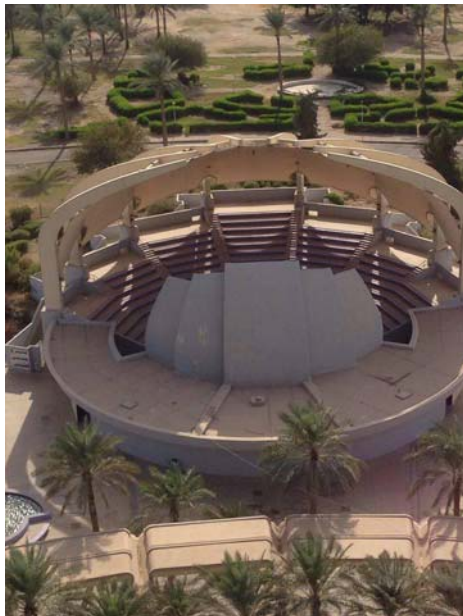
Fig. 15. A view of the park and amphitheatre from the tower

eg. amphitheatre (Fig. 15). In the southern part of the lake there is the island of weddings (Fig. 16). Currently, on an area of 125 hectares there is located 50-metre tower Al Jazeera, restaurants, wedding halls, bowling alley, cinema, sports fields, marina, the lake of the area of 2 ha, amphitheatre, hotel, conference rooms, a casino and a planetarium. The property is visited by 5–6 thousand people and by up to 100,000 visitors during summer holidays and public holidays. Baghdad Island is a place dedicated to middle-class families and school trips. In the park you can play football, tennis or go for a swim on a variety of boats. It is located in the vicinity of irrigated fields and palm orchards with nice climate.