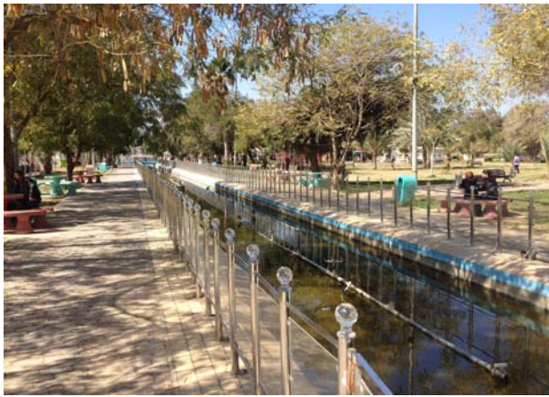
Fig. 4. Along the alleys near the seats there are moisturizers and air cascade canals