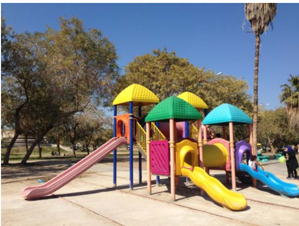
Fig. 10. Playground with modern, colourful playground equipment

Surrounded by gardens Zaawara Tower with a height of 60 m, has two restaurants and cafes, and can accommodate 170 people. The top of the tower offers a view of the park and the city. One of the most important objects is Planetarium – performing the research and educational functions. It is also a museum and amateur radio. In the park there are plenty of eateries, cafés and shops (Fig. 9). From modest kiosks to the most sophisticated restaurants, eg. Al Lulua (‘a pearl’) which roof is topped with a dome similar to a pearl. There is also an open-air cinema, mini golf, a playground (Fig. 10), the amusement park (Fig. 11) and the zoo. Good selection and proper placement of utilitarian components in the park improves the aesthetics of the place and it serves both tourists and the service personnel. The