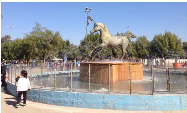
Fig. 5. Arabian horse (Flying Horse) surrounded by fountains

especially in the eastern part of the park, made in different styles, eg. classical sculpture of a physician and scholar (Farabi) near the Natural History Museum, an Arabian horse (Flying Horse) surrounded by fountains near a popular meeting place (Fig. 5), contemporary art (Fig. 6) and vertical flowerbed depicting the butterfly (Fig. 7). In addition, the space of the park is decorated with some objects characteristic of a given season: Pergola with hearts for Valentine's Day or the enormous Christmas tree to celebrate Christmas. The air surrounded by benches is moisturized by water cascade. Tall trees cast a shadow on the walking paths and seating places. Along them there are also water canals with the fountains. One avenue runs under the pergola formed out of the bushes (Fig. 8).