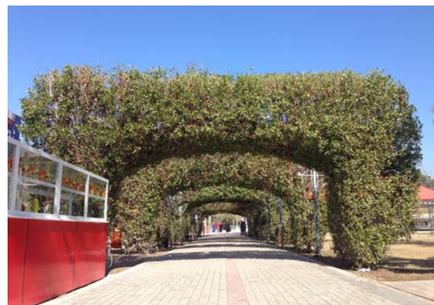
Fig. 8. Pergola with molded bushes on a walking alley