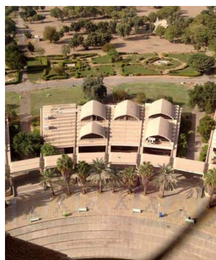
Fig. 14. A view of the park and landscape