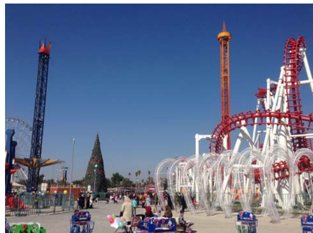
Fig. 11. Attraction at the amusement park is a rollercoaster. There are also Christmas installations

area is illuminated by, among others, lamps powered by solar energy and equipped with electronic information boards. Distributed high light poles on the sides of the main streets and lanes, parks and green spaces within the well. Turn signals at crossroads and other signs are in white and blue colours. Benches are placed along the roads around the lake and in themed gardens. Many of them are covered. In the park there are also buildings where you can cool off in the air-conditioned room. Vegetation of the park includes trees and shrubs (Table 1 and 2), palms (Table 3) and water plans (Table 4).