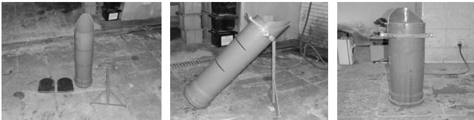
Fig. 2. Set evaluating resistance of SCC to vertical segregation

Segregation resistance. In order to evaluate the resistance of self-compacting concrete to the vertical segregation, fresh concrete was poured into a plastic vessel ( \phi 150 mm, h = 495 mm). The vessel had two thin cuts for putting metal partitions and dividing the concrete sample into three parts (Fig. 2). After 20 minutes needed for vertical moving the aggregate in the vessel, partitions were fixed in the cuts. The concrete of the upper, middle and bottom parts were put through an 8 mm sieve, and the aggregate pieces coarser than 8 mm were washed out from the sample. The coarse aggregates of three parts were dried and weighted. MC Bauchemie has developed the method and claims that, when the differences between the upper, middle and bottom sections are lower than 20%, there is no segregation in self-compacting concrete in the vertical direction.