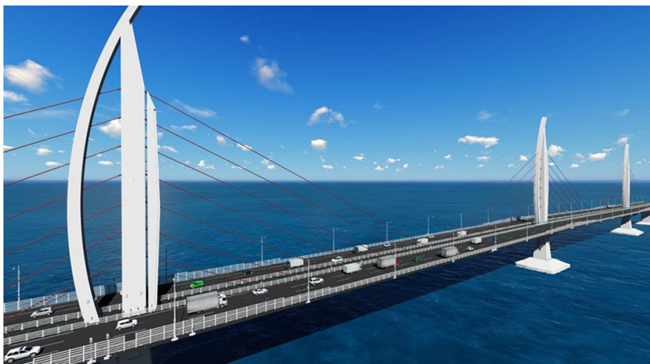
Fig. 1. 3D-model of a part of the Hong Kong-Zhuhai-Macau bridge

The tunnel section is about 6.7 km long and the bridge section is 22.9 km long. In addition, two artificial islands were built. This large-scale project was completed in December 2017.