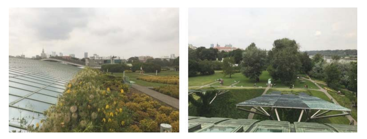
Fig. 1. Warsaw University Library roof garden