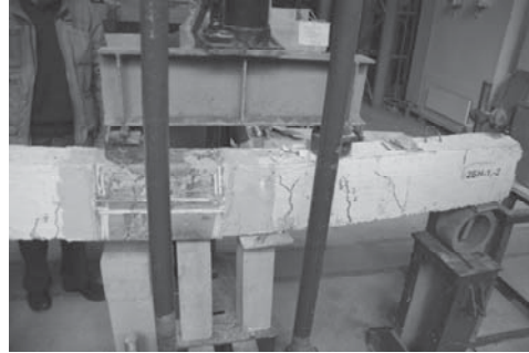
Fig. 3. The nature of re-fracture zone of the upper beams of the sixth series

nificant restoration of carrying capacity of impregnated samples. The strength of normal cross section of the beam (2BH-13-4-1BH-13-6) after treatment was 85–88% of their initial strength of normal cross section defined in Luchko et al. [2012]. And the destruction of the upper zone beam held in places where there was no treatment (Fig. 3). The nature of re-fracture zone of the upper beams of the sixth series shown in Figure 3.