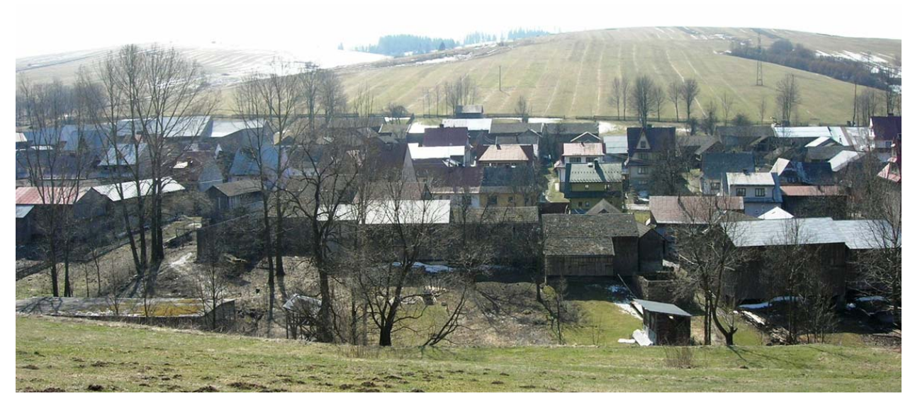
Fig. 1. Middle part of the village of Trybsz in Spisz viewed from the north

Polish Spisz is a unique, distinctive region where one can still find remains of past divisions resulting from its historic incorporation into Hungary. After World War II, the period of "building" socialism in