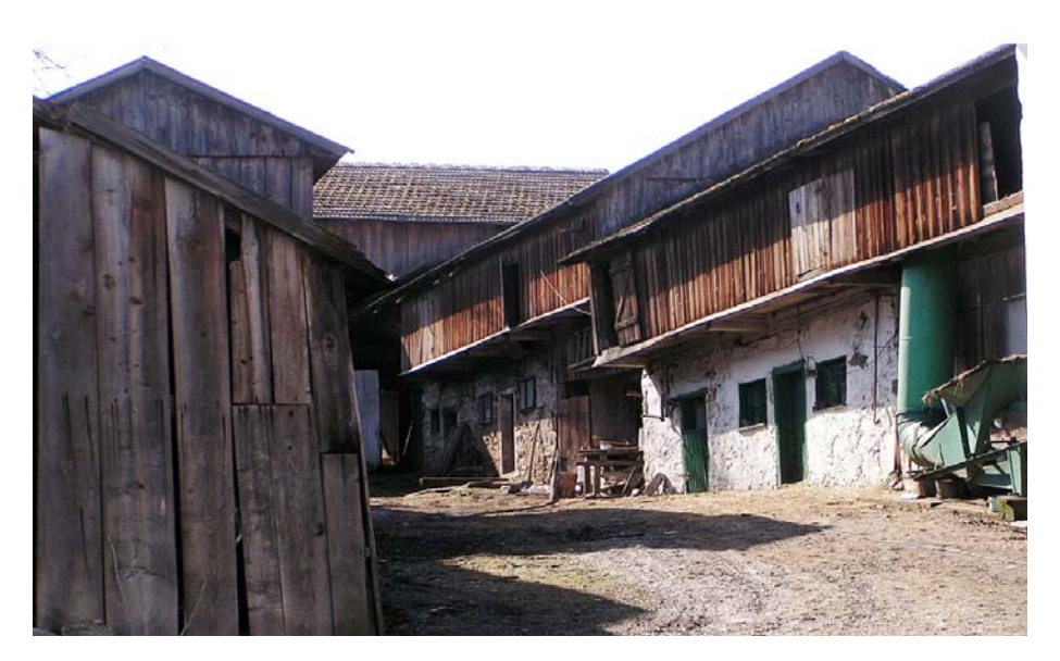
Fig. 7. Farmyard in the middle part of Trybsz. Visible overhanging attics over farm buildings