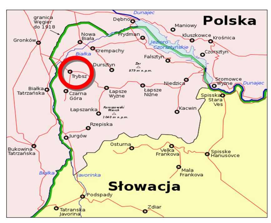
Fig. 2. Map of Polish Spisz with the village of Trybsz

The aim of the paper was to present the development of farm buildings associated with social and economic changes in the Polish part of Spisz over the last 50 years, based on the example of the village of Trybsz.