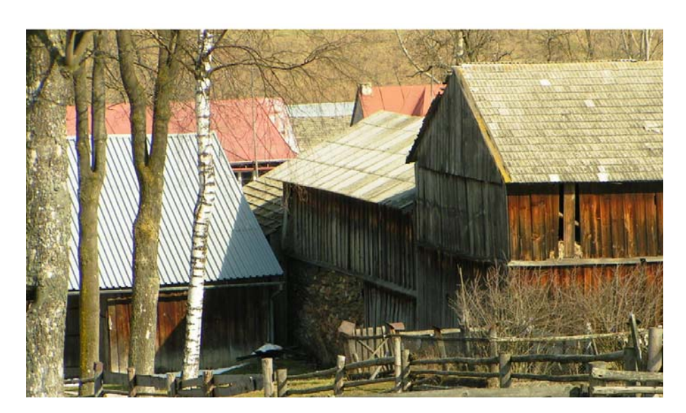
Fig. 4. Part of farm buildings in Trybsz, viewed from the south

As shown by the analysis of the results of the research, initially, the average height of livestock buildings with a functional attic was 5.5–6.5 m (Fig. 5a).