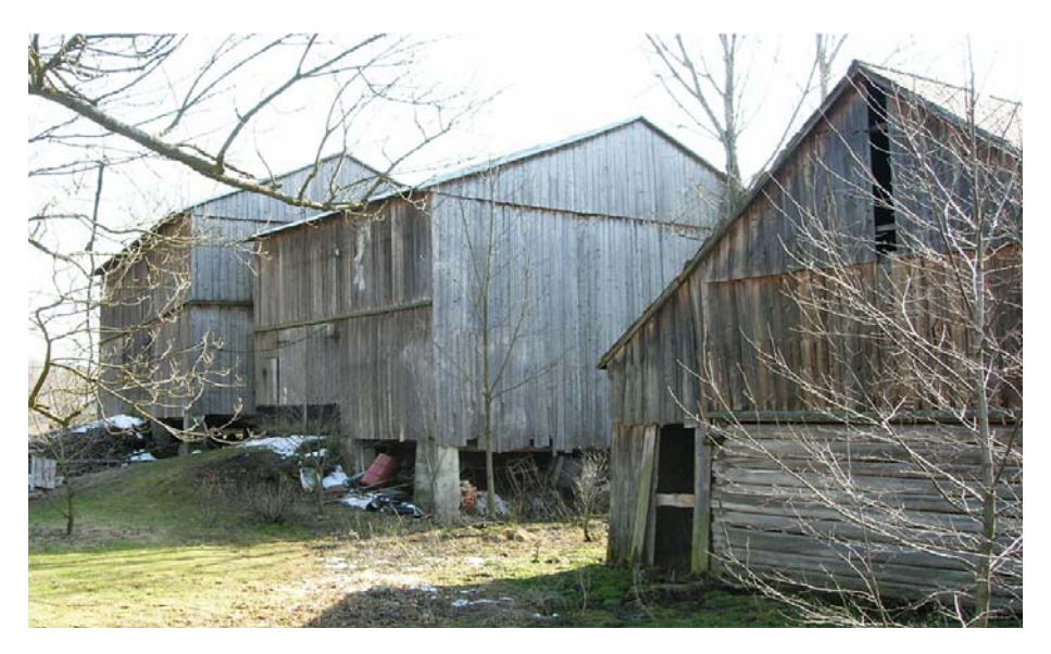
Fig. 6. Part of utility developments in Trybsz. In the foreground we can see a low building erected before 1950, while in the back there are more recent buildings with high knee walls

When that was not enough, further enlargement of the cubic area was obtained by widening the attic in the cross-section of buildings (Figs. 5d, 5e). Such expansions were usually made by way of a unilateral overhang (of about 1.0–1.2 m) above the livestock building, situated towards the yard (Fig. 7).