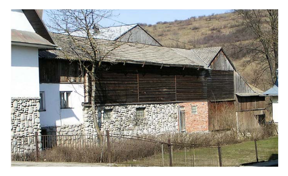
Fig. 9. The wall of a farm building in Trybsz with a high knee wall and various construction materials used

After changes in the political system in 1989, agricultural production in Spisz became uneconomic and therefore was radically limited, taking on the characteristics of organic farming, where production volumes are adapted to the needs of a given household