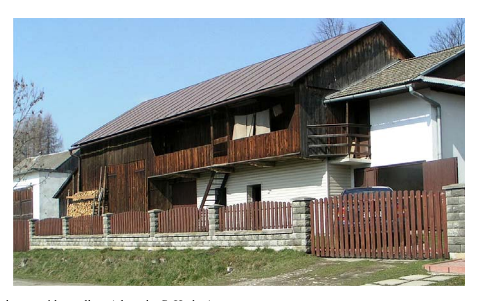
Fig. 8. Farmhouse with a gallery

In general, it should be noted that there are a very limited number of scientific publications on a subject similar to the research presented. Most of the studies concern the Podhale and Orava regions. The majority of papers on the Polish Spisz are of ethnographic, tour-