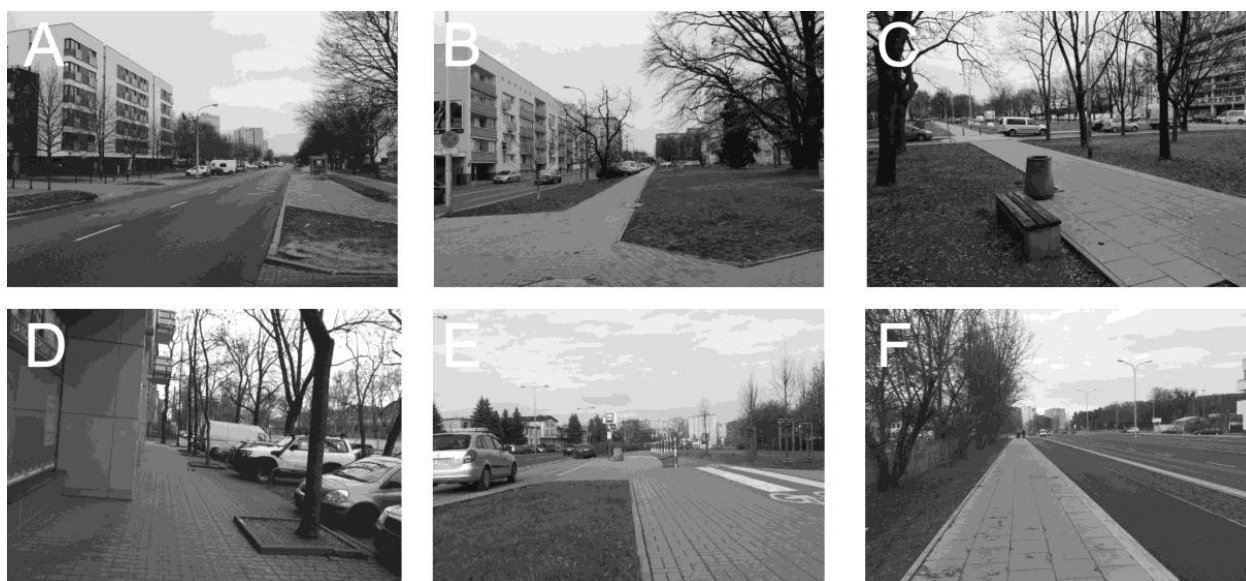
Fig. 3. Research points: A – Szczęśliwicka street, B – Białobrzaska street; C – Dickensa street; D – Czerska street; E – Rolna street; F – Kasprowicza street (own elaboration)