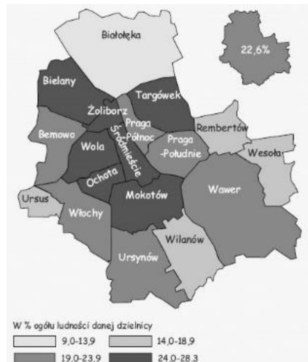
Fig. 1. Population at post-working age given as a percentage of the total population of the district in 2015 (source: https://www.bankier.pl/i/n/201502/kJv9y-WY5hRvw_m3dc7c720.png , access 06.12.2018)