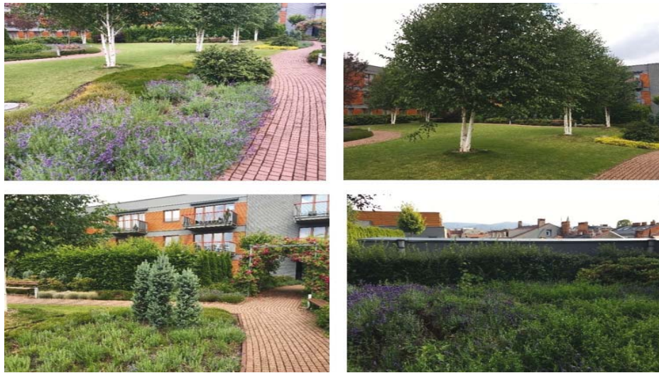
Fig. 8. Garden irrigated by an automatic irrigation system powered by rainwater tanks (Boas Berg et al., 2017)

species. A special irrigation system has also been created – rainwater flows to the tanks (the rainwater drainage system is not connected to a drainage system for municipal sewage). Rainwater from the roof of the Sfera II shopping center is used for watering plants in the garden (Boas Berg et al., 2017).