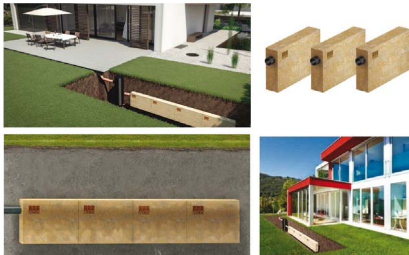
Fig. 6. Infiltration is beneficial for groundwater level, infiltration blocks allow safe flow of rainwater into the garden, photos of underground infiltration system ( www.acogarden.be/nl )