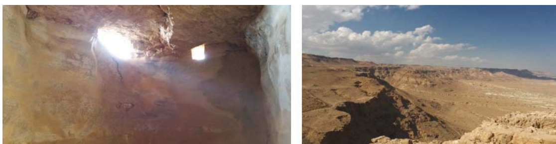
Fig. 2. Rainwater tanks (cisterns), carved in the Masada rock (Boas Berg, Radziemska, Adamcová & Vaverková, 2017)