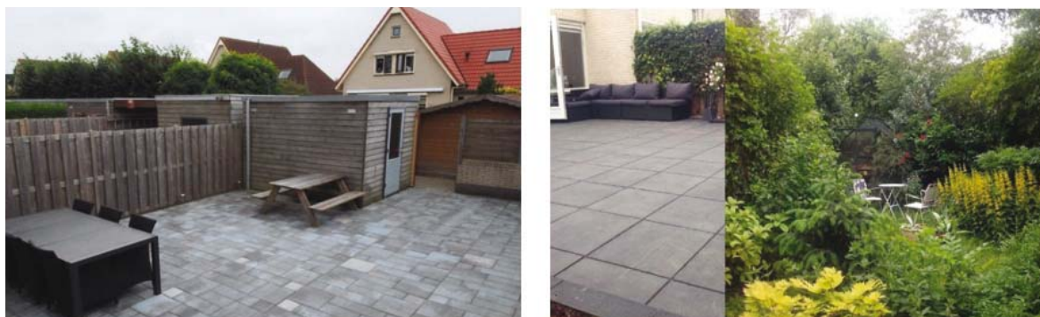
Fig. 9. Pictures of the concrete garden of the municipality of Altena

by the Dutch municipality of Altena (North Brabant province). From January 1, 2018, the municipality will charge a higher tax on sewage if the owner paves his garden. The tax on the paved garden will be collected from the property owner because the tiles cause too much pressure on the sewage system, which leads to flooding. In the green garden, the water is better absorbed in the ground. Thanks to this plan, the municipality wants to make citizens aware of problems with draining water and encourage them to install grass in the garden instead of hardening the surface (Fig. 9; www.gemeente.nu ).