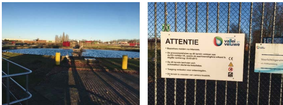
Fig. 3. Water treatment plant in Apeldoorn (Boas Berg et al., 2017)