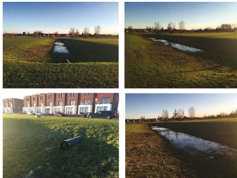
Fig. 4. Pictures of a wadi in a newly built housing estate in the municipality of Apeldoorn (Boas Berg et al., 2017)

due to clogging of infiltration devices, especially when synthetic filters are used.