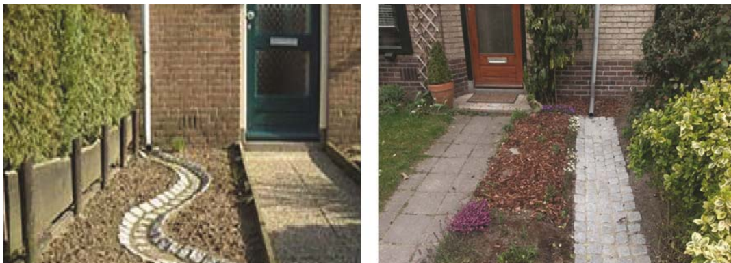
Fig. 7. The pipe is cut off and the water drain is paved so that the surface cannot be washed away

ground outflow (Fig. 7), from which water gets to the holes located on the municipal road. The water flows through the openings to the tank with stone filters and then joins the groundwater. Graywater from houses and blackwater is transported to the municipal sewage and is not mixed with rainwater. Another solution is the wadi mandatorily included in the newly built housing estates, companies and offices structures in the Netherlands. Rainwater is being transported to a wadi. A wadi has a natural permeable bottom. The water penetrates through stone filters and powers groundwater.