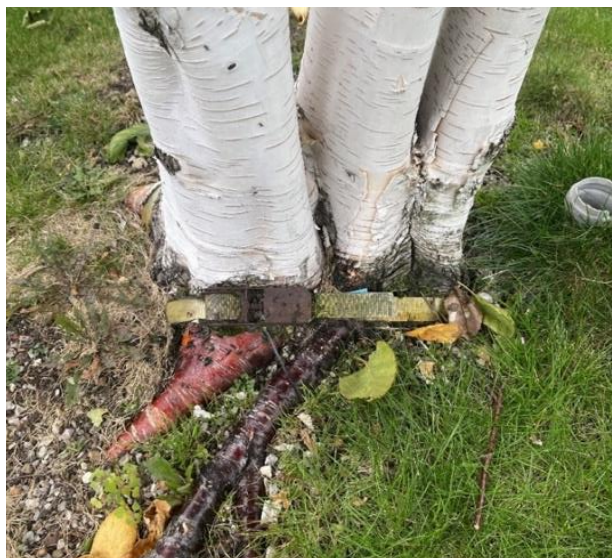
Fig. 5. Trees secured with special strips on Sfera II Shopping Centre (photo by A. Boas Berg, 2021)