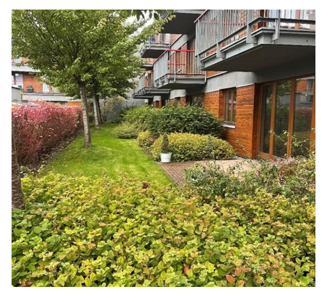
Fig.4. Residential development and roof garden on the Sfera II Shopping Centre

Ordinary soil should not be used in the substrate, as it usually contains floating particles (e.g. clay) which accumulate on the layers below (filter fabric) and reduce its filtering properties and cause water stagnation. Neither should too much peat be used. In intensive green roofs, the proper choice of layers is an extremely important aspect. The choice of layers