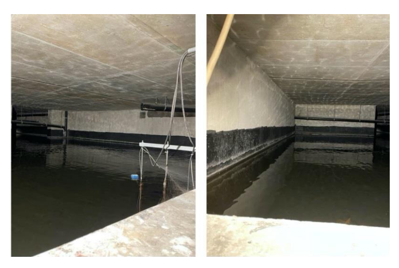
Fig. 3. Rainwater harvesting tank under the Sfera II Shopping Centre