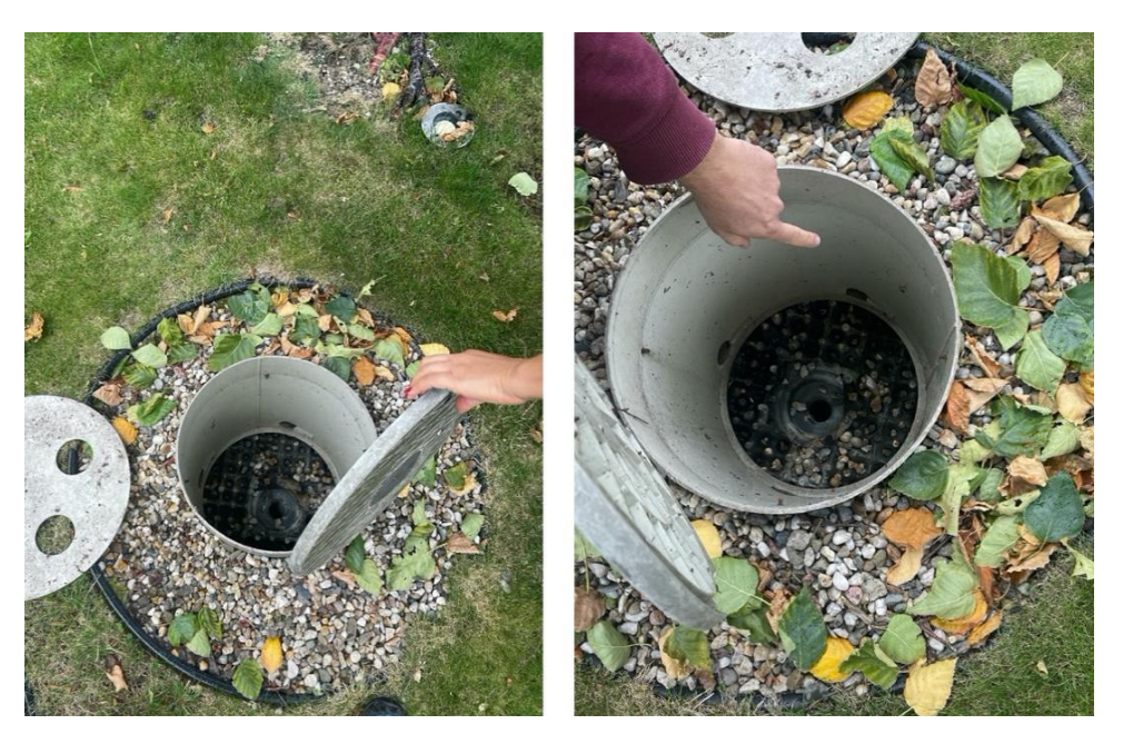
Fig. 6. The water drainage system on Sfera II Shopping Centre

is critical in terms of the functioning of the roof space in question (fire routes, circulation paths, roof garden, etc.). The layers must be chosen so that the entire roof system functions efficiently and allows the planted vegetation to grow and develop.