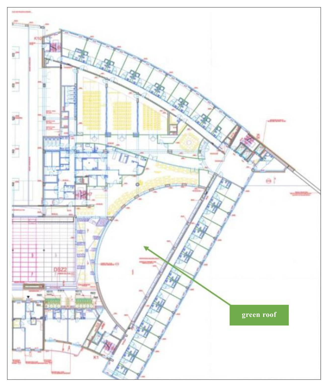
Fig. 2. Technical documentation of the intensive green roof on the Sfera II Shopping Centre

Boas Berg, A., Hurajová, E., Černý, M., Winkler, J. (2022). Anthropogenic ecosystem of green roofs from the perspective of rainwater management. Acta Sci. Pol. Architectura, 21 (1), 9–19, doi: 10.22630/ASPA.2022.21.1.2