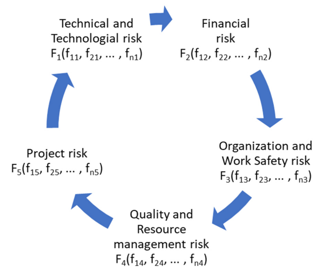
Fig. 3. Risk class: f_{1i} – lowest risk (1); f_{2i} – low risk (2); f_{3i} – satisfactory risk (3); f_{4i} – high risk (4); f_{ni} – the highest risk (5); final class decisions (own work)

This research was made by analysis of every each information from the experts who have had experience in high rise of building construction projects in the mining areas. It was made to obtain recommended corrective actions needed for controlling material cost variance, the variables used in this research consist of cause of the variable and corrective action variable to anticipate the variance of risk class of construction investment in the areas with mining impact (Fig. 3).