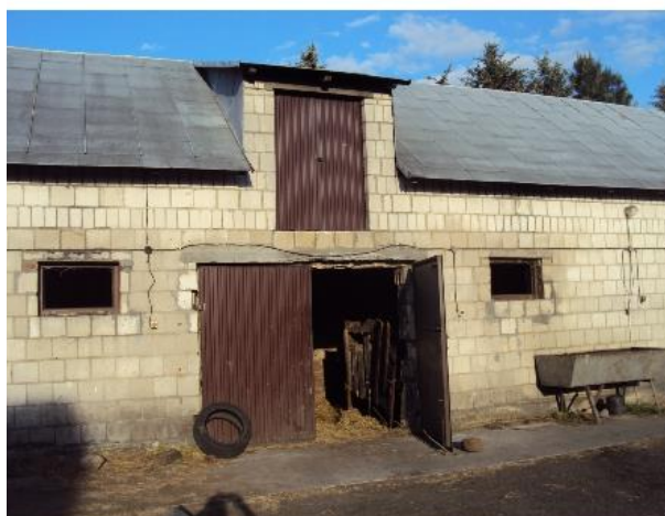
Fig. 6. Cowsheds in the investigated farms