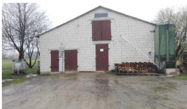
Fig. 4. Sheep sheds in the investigated farms