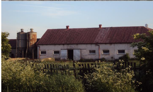
Fig. 5. Stables in the investigated farms