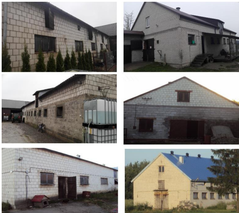
Fig. 3. Piggeries in the investigated farms