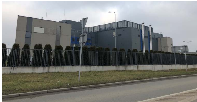
Fig. 1. The Data Center building – near Ożarów in Poland